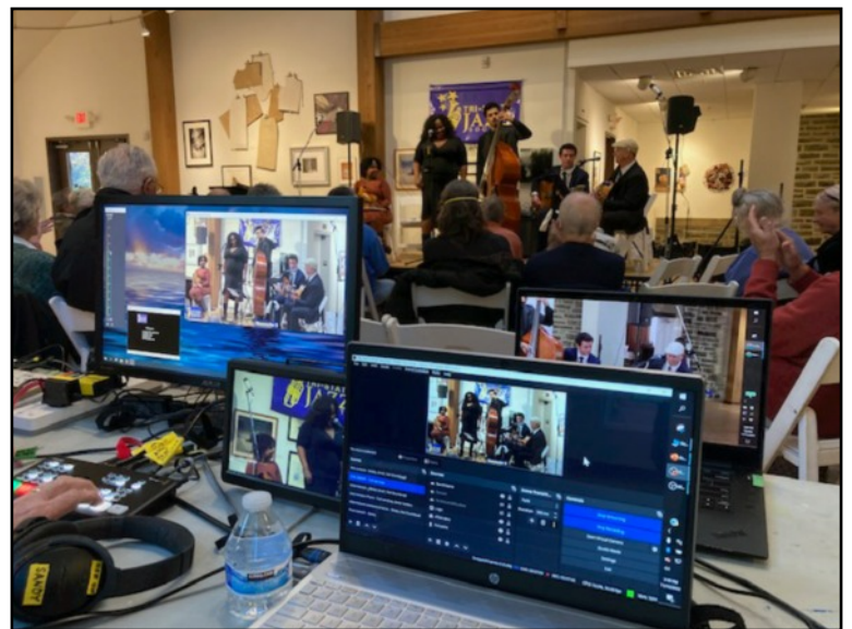
The tech table

If you like gypsy jazz, look no further than Manouche 5. You can expect to see them again at Tri-State.