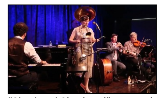
"Oh Johnny! Oh Johnny!" on YouTube