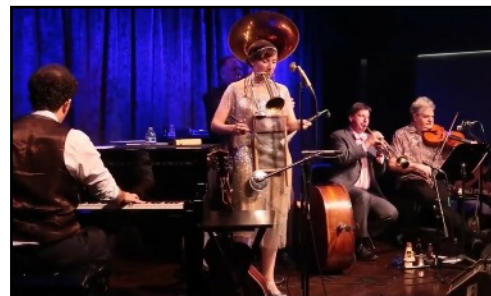
“Oh Johnny! Oh Johnny!” on YouTube