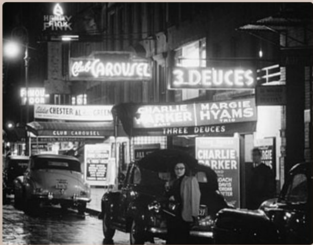
52nd Street, New York City in the 1940s.

The action on 52nd Street started during Prohibition. Joe Helbock, bootlegger, bartender and self-appointed patron of jazz, counted Teddy Roosevelt as one of his best customers for home delivery of booze. “We were polite bootleggers,” Joe said, “We made our deliveries in brief cases instead of paper bags.” Helbock opened the Onyx Club in 1927 in a one-room, walk-up apartment in a brownstone on 52nd Street. The walls were decorated with black and silver stripes, with a black marble bar at the back. Joe knew every musician in town. The Onyx Club became the hangout for his friends. Jimmy and Tommy Dorsey, Art Tatum, Maxine Sullivan and Louis Prima all started their careers at The Onyx. Jim Cullum says, “This was a place where musicians could pick up phone messages or have their mail delivered, or even leave their horns for safekeeping.”