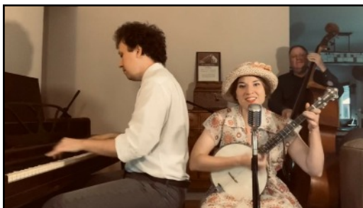
“Where’d You Get Those Eyes” on YouTube